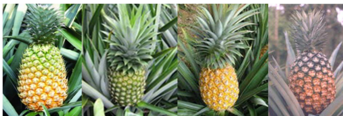
Mauritius MD-2 Amrutha Kew